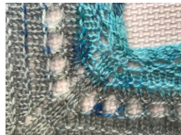
Short side, top, tab, join