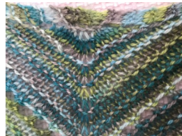
Long side, top, tab start

Eyelet WS Row: K3, sm, k to last m, sm, k3